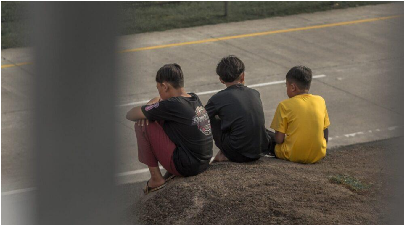
Driven under the administrative radar, undocumented children face severe healthcare fragmentation, missing crucial developmental screenings and continuous medical support.