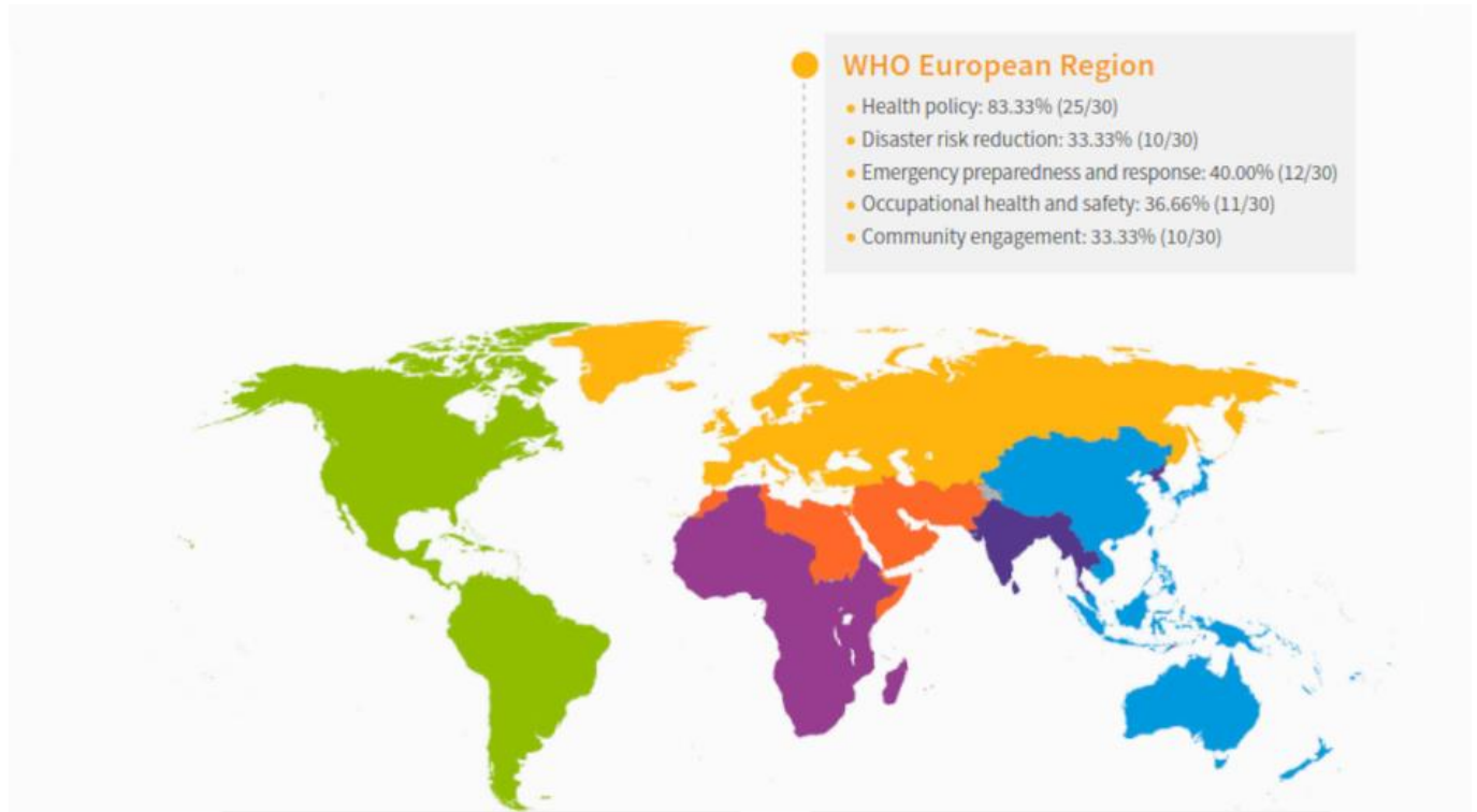
WHO data on inclusion of refugee and migrant health aspects in national policies, legislation strategies or plans across thematic areas in the European Region.

Even in jurisdictions with progressive entitlements specifically designed for undocumented populations, such as France – where, notably, children cannot legally be classified as undocumented – administrative labyrinths and illegal discrimination by providers severely limit practical access. Although the French State Medical Aid guarantees free access to essential care after three months of residency, eligible patients are still frequently turned away by providers who illegally refuse to treat those relying on state support.